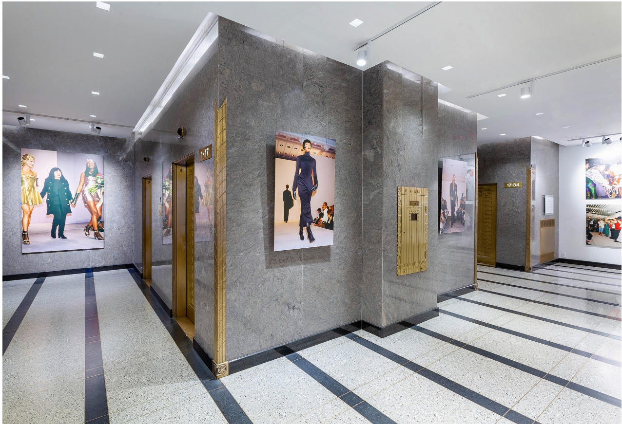
From 'New York Fashion Rediscovered' in the ZAZ10TS gallery in Times Square, New York City.